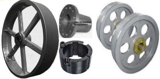
TAPER SLEEVE PULLEYS UPTO 2000MM DIA