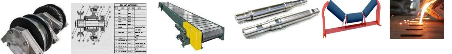
CRANE WHEEL ASSEMBLY